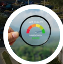
Air Quality Indicators