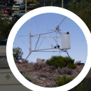
Fire Weather Data