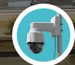
AI Smoke Detection

AEM's comprehensive ignition detection sources