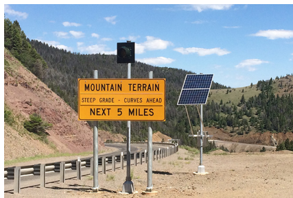
ROAD WEATHER SENSORS AT CRITICAL LOCATIONS