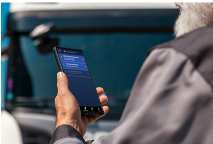
MOBILE WEATHER ALERTS